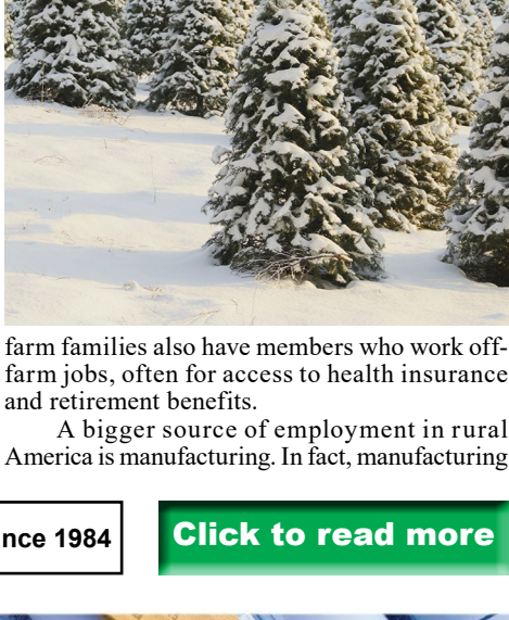
farm families also have members who work off-farm jobs, often for access to health insurance and retirement benefits. A bigger source of employment in rural America is manufacturing. In fact, manufacturing

Myth 1: Rural America is disappearing due to depopulation Many people think that rural America is emptying out. The story is more complicated. It's true that between 2010 and 2020 most rural counties lost population. But about one third grew, especially those near cities or those with lakes, mountains and other natural attractions. And there have been times, like in the 1970s and 1990s, when rural populations grew faster than cities—periods called “rural rebounds.” An important thing to know about rural population change is that places defined as “rural” can change over time. When a rural town grows enough, the United States Office of Management and Budget reclassifies it as “urban.” In other words, rural America isn't disappearing—it's changing and sometimes urbanizing. Myth 2: Most rural Americans live on farms Farming is still important in many rural places, but it's no longer the way most rural Americans make a living. Today, roughly six percent of rural jobs are in agriculture. And most